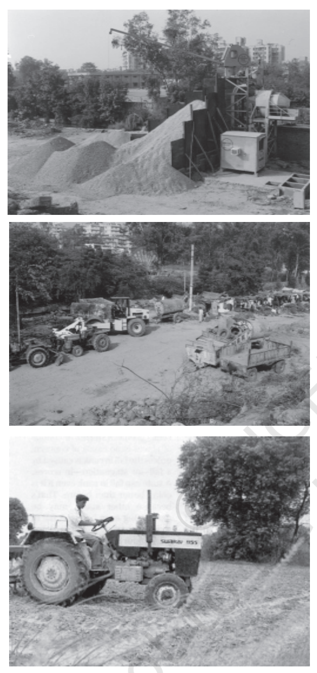
Changing technologies in agriculture