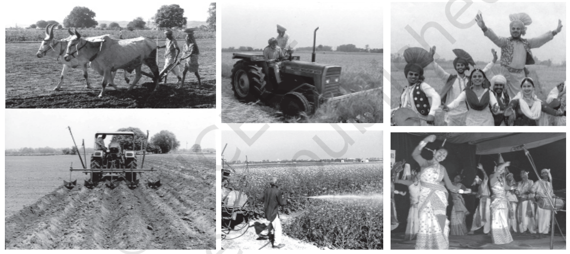
Different means of agriculture and related festivals.

Indian society is primarily a rural society though urbanisation is growing. The majority of India's people live in rural areas (67 per cent, according to the 2001 Census). They make their living from agriculture or related occupations. This means that agricultural land is the most important productive resource for a great many Indians. Land is also the most important form of property. But land is not just a 'means of production' nor just a 'form of property'. Nor is agriculture just a form of livelihood. It is also a way of life. Many of our cultural practices and patterns can be traced to our agrarian backgrounds. You will recall from the earlier chapters how closely interrelated structural and cultural changes are. For example, most of the New Year festivals in different regions of India – such as Pongal in Tamil Nadu, Bihu in Assam, Baisakhi in Punjab and Ugadi in Karnataka to name just a few – actually celebrate the main harvest season and herald the beginning of a new agricultural season. Find out about other harvest festivals.