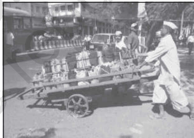
Fig. 7.4: Dabbawala Service in Mumbai

Personal services are made available to the people to facilitate their work in daily life. The workers migrate from rural areas in search of employment and are unskilled. They are employed in domestic services as housekeepers, cooks, and gardeners. This segment of workers is generally unorganised. One such example in India is Mumbai's dabbawala (Tiffin) service provided to about 1,75,000 customers all over the city.