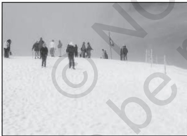
Fig. 7.5: Tourists skiing in the snow capped mountain slopes of Switzerland

Tourism is travel undertaken for purposes of recreation rather than business. It has become the world's single largest tertiary activity in total registered jobs (250 million) and total revenue (40 per cent of the total GDP). Besides, many local persons, are employed to provide services like accommodation, meals, transport, entertainment and special shops serving the tourists. Tourism fosters the growth of infrastructure industries, retail trading, and craft industries (souvenirs). In some regions, tourism is seasonal because the vacation period is dependent on favourable weather conditions, but many regions attract visitors all the year round.