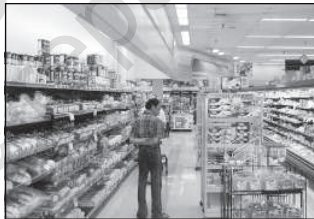
Fig. 7.3: Packed Food Market in U.S.A.

Urban marketing centres have more widely specialised urban services. They provide ordinary goods and services as well as many of the specialised goods and services required by people. Urban centres, therefore, offer manufactured goods as well as many specialised markets develop, e.g. markets for labour, housing, semi or finished products. Services of educational institutions and professionals such as teachers, lawyers, consultants, physicians, dentists and veterinary doctors are available.