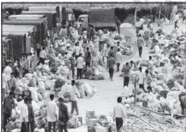
Fig. 7.2: A Wholesale Vegetable Market

Rural marketing centres cater to nearby settlements. These are quasi-urban centres. They serve as trading centres of the most rudimentary type. Here personal and professional services are not well-developed. These form local collecting and distributing centres. Most of these have mandis (wholesale markets) and also retailing areas. They are not urban centres per se but are significant centres for making available goods and services which are most frequently demanded by rural folk.