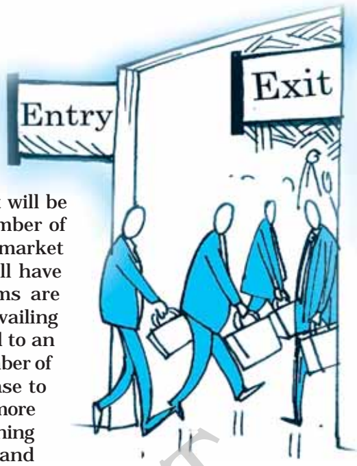
Free for all

To see why it is so, suppose, at the prevailing market price, each firm is earning supernormal profit. The possibility of earning supernormal profit will attract some new firms which will lead to a reduction in the supernormal profit and eventually supernormal profit will be wiped out when there is a sufficient number of firms. At this point, with all firms in the market earning normal profit, no more firms will have incentive to enter. Similarly, if the firms are earning less than normal profit at the prevailing price, some firms will exit which will lead to an increase in profit, and with sufficient number of firms, the profits of each firm will increase to the level of normal profit. At this point, no more firm will want to leave since they will be earning normal profit here. Thus, with free entry and exit, each firm will always earn normal profit at the prevailing market price.