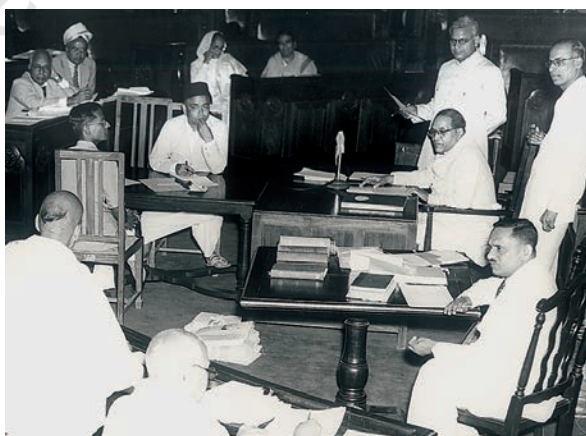
Dr. B.R. Ambedkar presiding over a discussion in the Constituent Assembly

Dr. B.R. Ambedkar CAD, Vol. VII, p.37, 4 November 1948