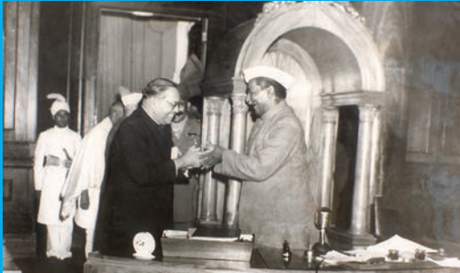
The President of the Constituent Assembly, Dr. Rajendra Prasad and the Chairman of the Drafting Committee, Dr. B.R. Ambedkar greeting each other

Constituent Assembly, where each clause of the Constitution was subjected to scrutiny and debate, is a tribute to public reason at its best. These debates deserved to be memorialised as one of the most significant chapters in the history of constitution making, equal in importance to the French and American revolutions.