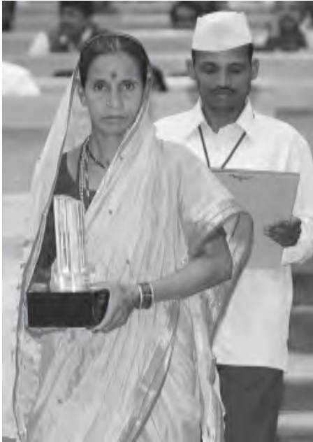
A woman Panch with her reward

importantly, control of local resources is given to the elected local bodies.