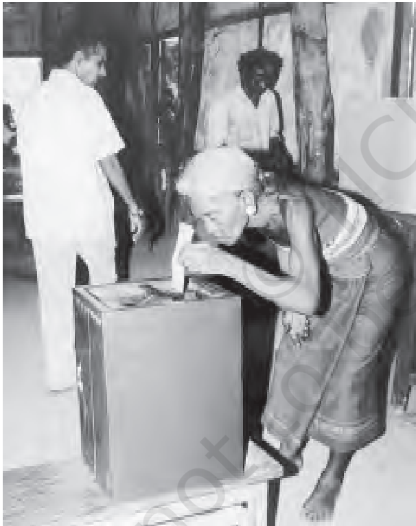
An old lady voting in election

Modern society, with its size and complexity, offers few opportunities for direct democracy. Today, the most common form of democracy, whether for a town of 50,000 or nations of 1 billion, is representative democracy, in which citizens elect officials to make political decisions, formulate laws, and administer programmes for the public good. Ours is a representative democracy. Every citizen has the important right to vote her/his representative. People elect their representatives to all levels from Panchayats, Municipal Boards, State Assemblies