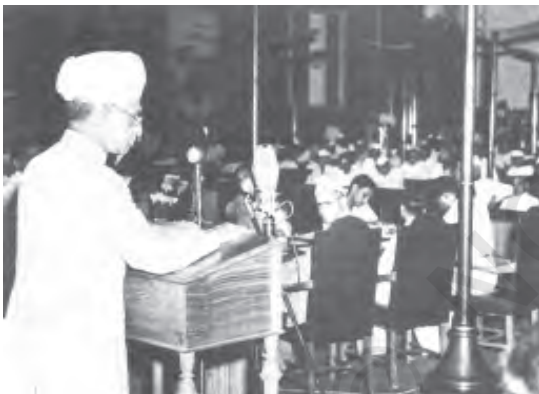
Sarvepalli Radhakrishnan addressing the Constituent Assembly

Read both the Karachi Resolution and the Preamble carefully. Identify the key ideas that exist in it.