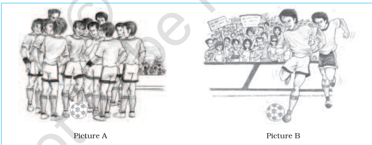
Fig.7.1 : Look at these Two Pictures

Picture A shows a football team — a group in which members interact with one another, have roles and goals. Picture B depicts an audience watching the football match — a mere collection of people who by some coincidence (may be their interest in football) happened to be in the same place at the same time.