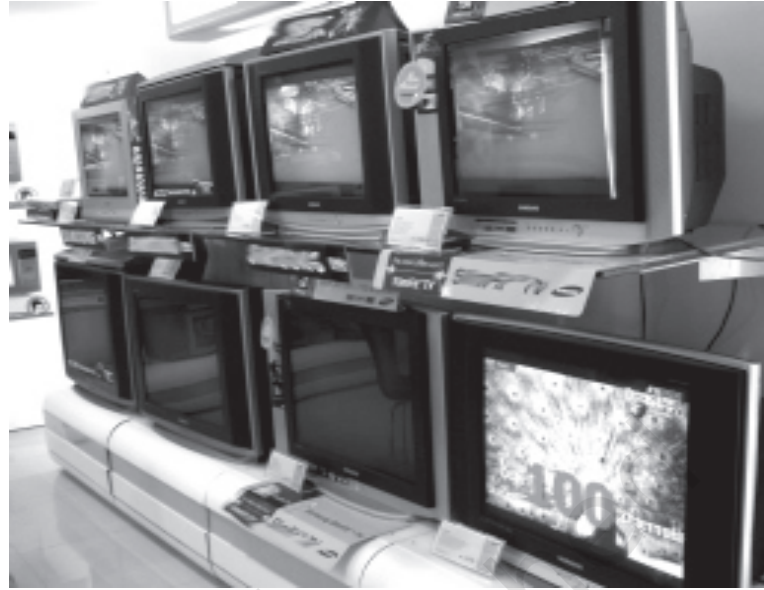
A television showroom

In 1991 there was one state controlled TV channel Doordarshan in India. By 1998 there were almost 70 channels. Privately run satellite channels have multiplied rapidly since the mid-1990s. While Doordarshan broadcasts over 20 channels there were some 40 private television networks broadcasting in 2000. The staggering growth of private satellite television has been one of the defining developments of contemporary India. In 2002, 134 million individuals watched satellite TV on an average every week. This number went up to 190 million in 2005. The number of homes with access to satellite TV has jumped from 40 million in 2002 to 61 million in 2005. Satellite subscription has now penetrated 56 percent of all TV homes.