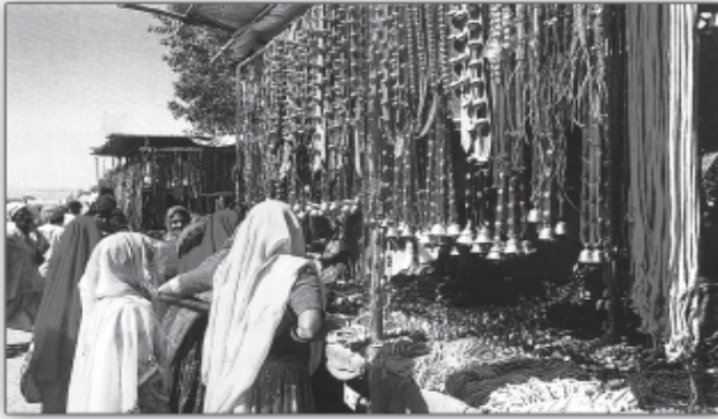
A weekly market in tribal area

The weekly haat is a common sight in rural and even urban India. In hilly and forested areas (especially those inhabited by adivasis), where settlements are far-flung, roads and communications poor, and the economy relatively undeveloped, the weekly market is the major institution for the exchange of goods as well as for social intercourse. Local people come to the market to sell their agricultural or forest produce to traders, who carry it to the towns for resale, and they buy essentials such as