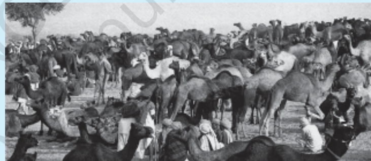
Cattle market in Pushkar fair

Read the passages in Box 4.4, which are taken from a guide book meant for foreign tourists. The passage illustrates the way in which a market – in this case the traditional annual cattle market and fair at Pushkar – can itself become a kind of product for sale in another market, in this case the market for tourism.