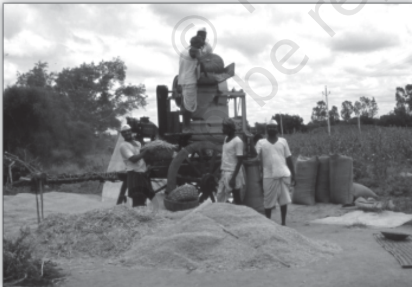
Agricultural work in a village

Many sociological studies of the Indian economy have focused on 'traditional merchant communities' or castes such as the Nakarattars. As you have already learned, there is a close connection between the caste system and the economy, in terms of landholding, occupational differentiation, and so on. This is also true in the case of trade and markets. In fact, 'Vaiyas' constitute one of the four varnas – an indication of the importance of the merchant and of trade or business in Indian society since ancient times. However, like the other varnas , 'Vaiya' is often a status that is claimed or aspired to rather than a fixed identity or social status. Although there are 'Vaiya' communities (such as baiyas in North